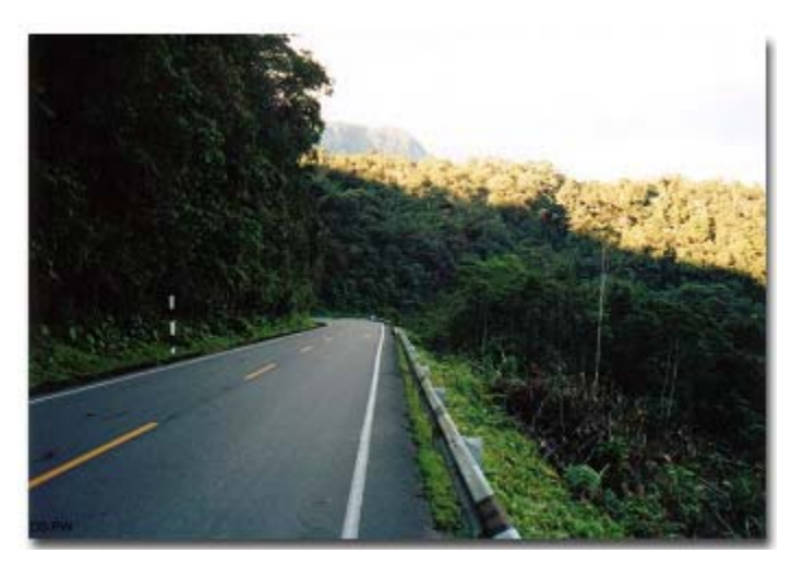
Highway that crosses through Alto Mayo Protected Forest

After the opening of the jungle highway (today, the Fernando Belaunde Terry highway) in 1974, the San Martín department in general and especially the Alto Mayo region underwent a severe environmental crisis due to the intense migration of Andean campesinos from Cajamarca and Amazonas that arrived constantly to settle in the area, including the interior of the Alto Mayo Protected Forest. This situation worsened due to the lack of political control and an insufficient and inefficient participation of the state institutions that are in charge of protecting the natural resources. The presence of a massive migratory population places the integrity and future of the natural protected area at great risk. The migrants are mostly rural farmers and on a smaller scale, traders, transportation providers and others looking for opportunities.