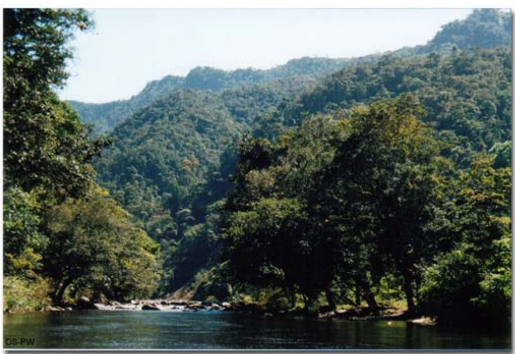
Mayo River in the interior of the Alto Mayo Protected Forest, photo © Diego Shoobridge.

The Alto Mayo Protected Forest is critically threatened . The principal threats include high levels of migration by Andean campesinos, territorial invasions, deforestation for agriculture or grazing, the illegal extraction and sale of orchids, butterflies, and other species, timber extraction, indiscriminant hunting of wild animals and unsustainable fishing practices. The impact of deforestation on the landscape of the Alto Mayo Protected Forest is significant and directly affects the habitat and the potential for tourism in the area.