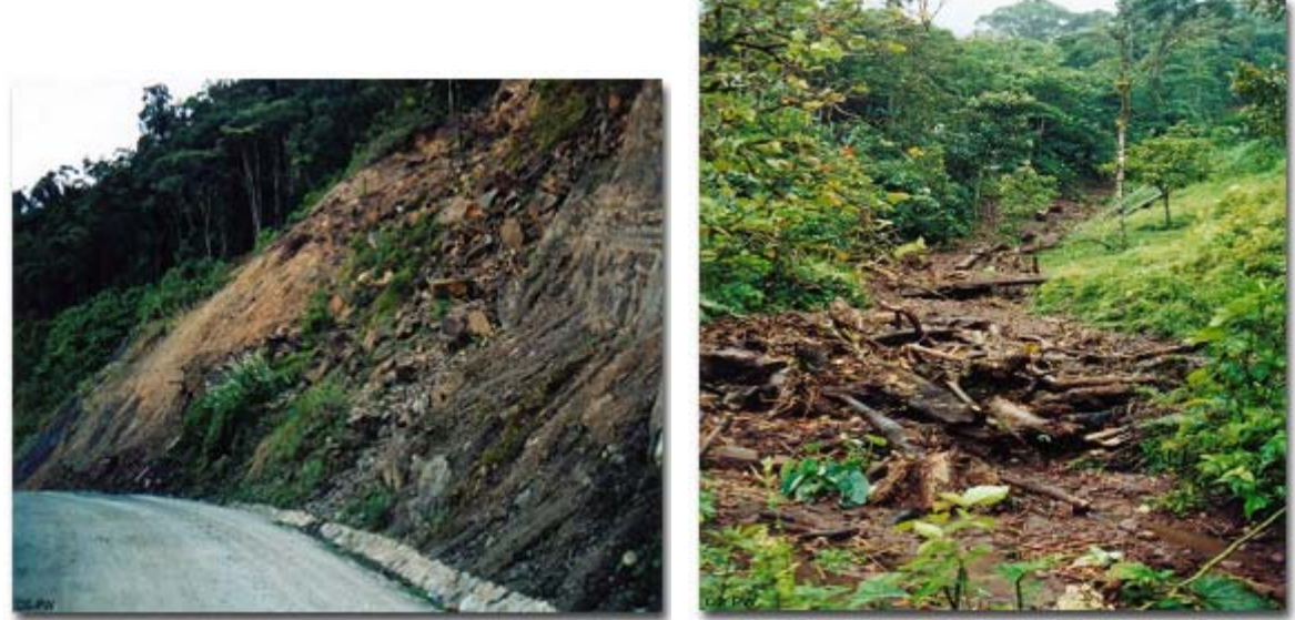
Landslides caused by deforestation, photos © Diego Shoobridge.