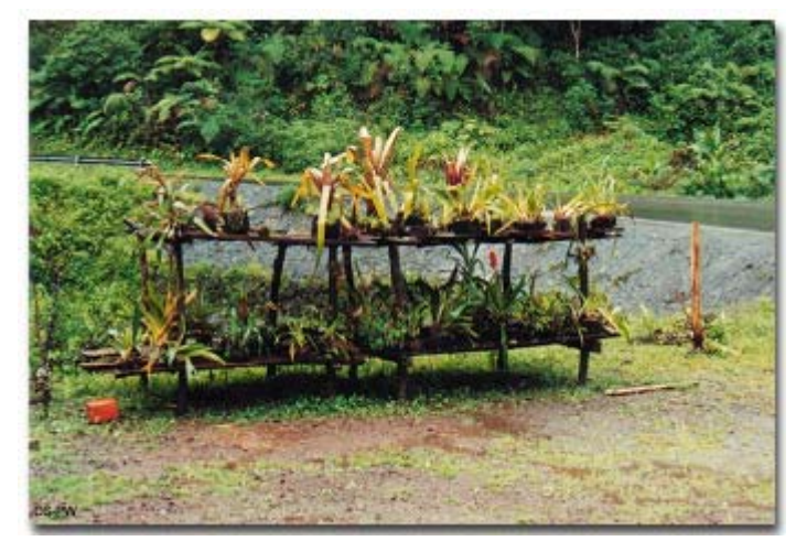
Illegal orchid sales along the highway.

Orchid sales are permitted only for cultivated plants. Article No. 279 of the Forest Law Rules establishes that