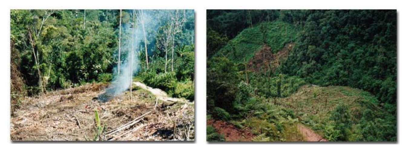
Deforestation in the interior of the Alto Mayo Protected Forest.

In the northern part of the protected area (in the Paríso, El Triunfo, Bello Horizonte, Candamo sectors among others) approximately 2000 hectares have been deforested, including secondary forest. In the south of the protected area, an estimated 350 hectares have been deforested, including secondary forest, for a total of between 2300 and 2500 hectares deforested in the interior of Alto Mayo Protected Forest.