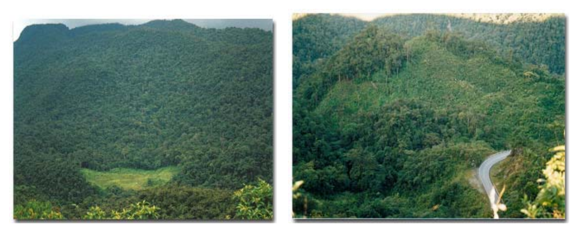
Deforestation in the interior of the Alto Mayo Protected Forest, photos © Diego Shoobridge.

The forest resources are not used in a sustainable way. In the lowest parts of the protected area, the forest has been severely affected and its destruction continues. The forest activities in the mountainous lands cause irreversible changes in the capacity of the vegetation and the soil to retain water. They are causing severe soil management problems. The imminent disruption and destruction of the vegetation on the mountain slopes causes difficulties in the control of water flow and erosion of the soil. Consequently, the loss of forest impedes the future sustainable use of the productive areas in the lowlands in the river basin.