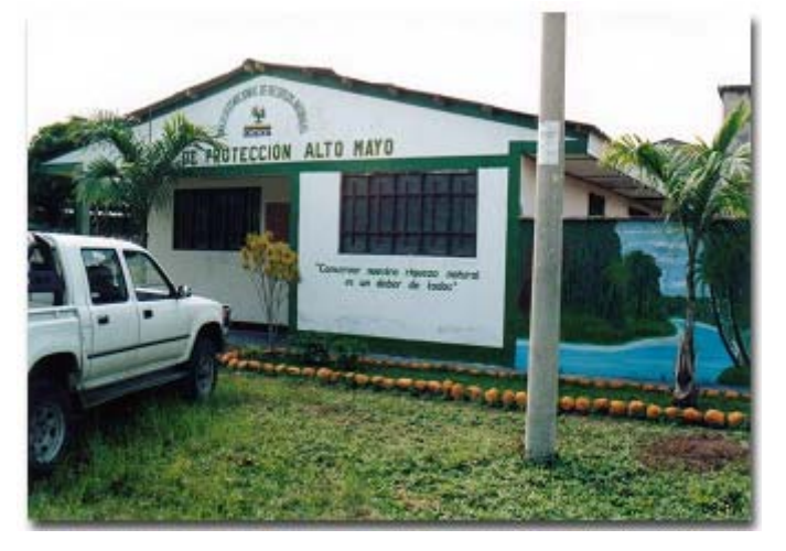
Administrative office in Rioja

All the institutions and sectors identified as stakeholders in the Alto Mayo area were notified with official documents about the rules and legal norms for the management of the natural protected area. This way, INRENA was established and