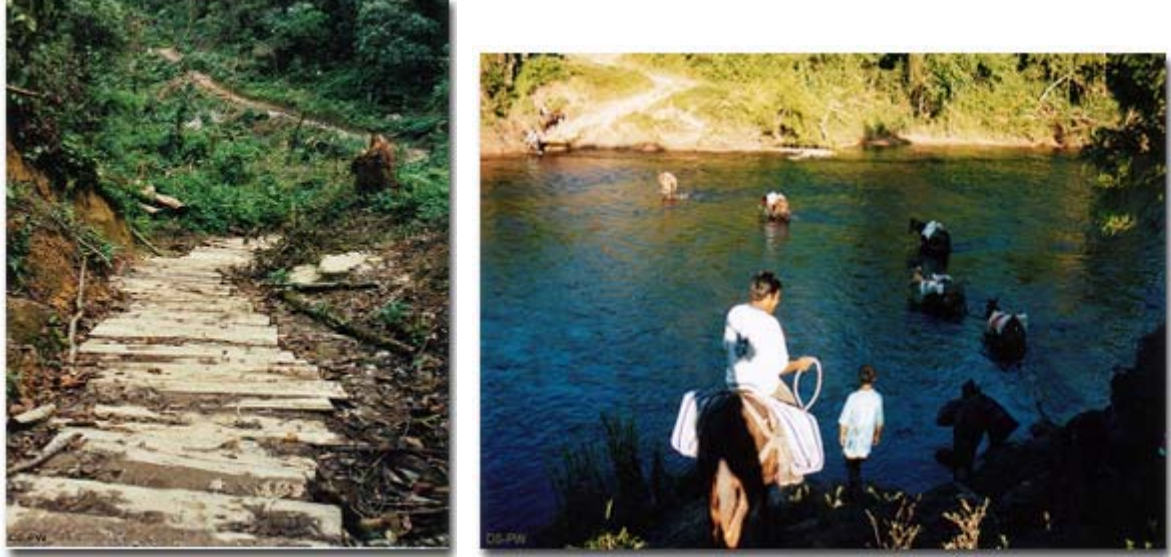
A trail in the southern part of the interior. The transport of cargo and supplies from the highway to the interior.