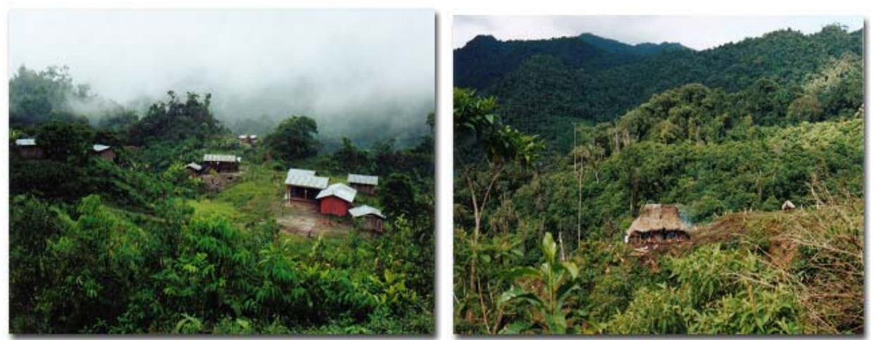
Human presence in the interior of the Alto Mayo Protected

Presently, the Aguarunas are dedicated to commercial agriculture of rice and coffee. A great part of subsistence agriculture has been left behind, remaining only in small garden plots. Hunting, fishing, and harvesting, complement these activities.<sup>16</sup>