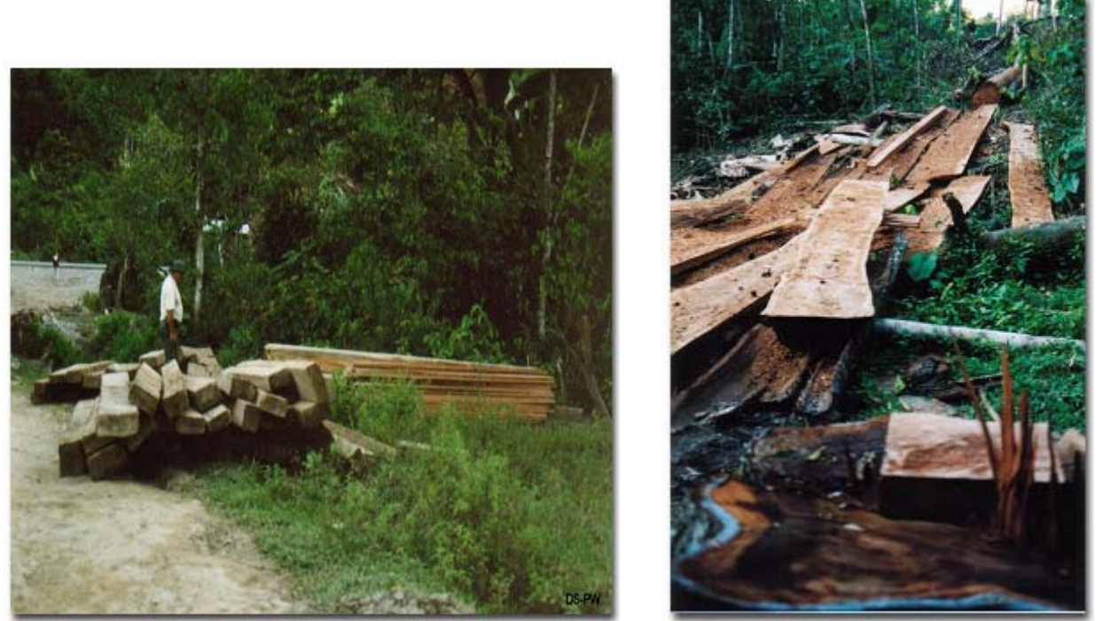
Illegally harvested wood seized by the area's administration and timber extraction in Alto Mayo

Thanks to our presence in the zone and our logistical support, the director of the area was able to pursue the wood extracted from the interior of the protected area. This wood was found at about six in the afternoon on the side of the highway, waiting to be loaded on a truck. The director called Aguas Claras forest patrol and the police to carry out the raid, following standard protocol. Both groups arrived where the wood was, the corresponding documents were drafted and the wood was detained. On the following day, the director returned to the area and the owner, despite the raid, had already removed the wood. This created confusion, distrust, and frustration. The forest control administration demonstrated its inefficiency and suspicious behavior. If this is how things work in the presence of the protected area's administration members, how does it function in raids that are carried out without their presence?