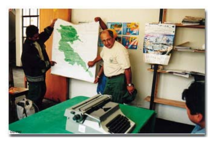
Initial approach and presentation to the authorities of Jumbilla (16/7/03).

The voluntary park guard program should be refined through constant qualification testing and workshops for the personnel, as well as through continuous coordination between the director of the protected area and the corresponding communities, through field supervision, coordination between offices, and better communication and shared information. It is important to keep a detailed register of the diverse events in the distinct sectors with voluntary park guards in order to document and standardize the experience and to identify the strengths and weaknesses of the program and possibilities for improvement.