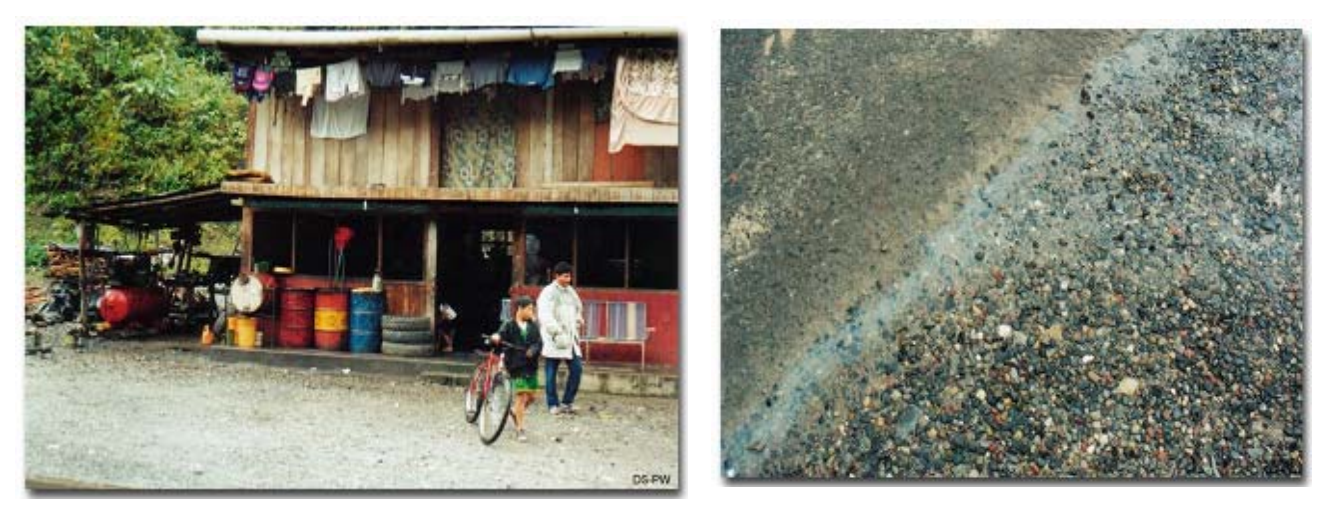
Local fuel station in the protected area, Drainage contamination from the station

The presence of small shops selling fuel in the interior of the protected area near the highway is a threat of contamination for the area, of both the air and the soil.