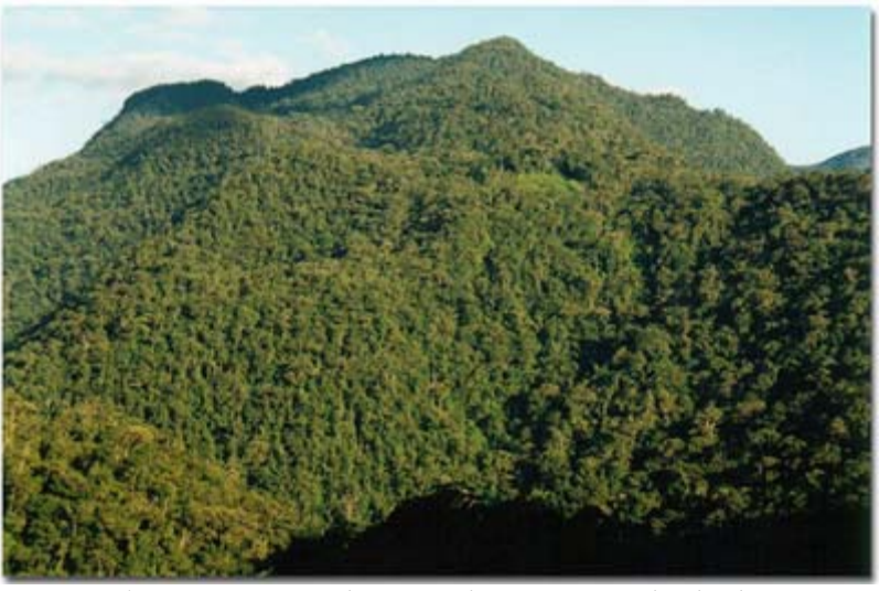
Alto Mayo Protected Forest

Operations should be carried out constantly, especially near the highway, in order to seize orchids, to dismantle the entire infrastructure associated with it, and to fine the violators. Timber extraction from the interior of Alto Mayo Protected Forest should be halted immediately. The local extractors and their respective suppliers that allow them to harvest the timber need to be identified. The responsible authorities must enforce the laws. Harvesting should be limited to areas outside of the protected area. The formation of management tools, specifically the Master Plan, is an absolute necessity.