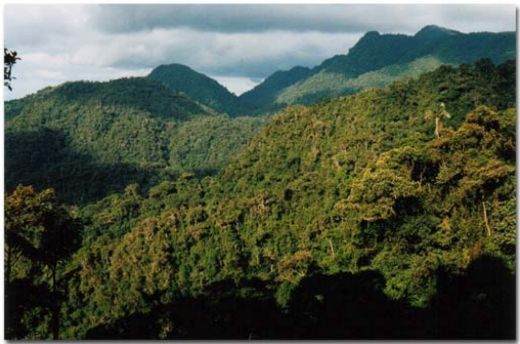
Southern part of Alto Mayo Protected Forest, photo © Diego Shoobridge