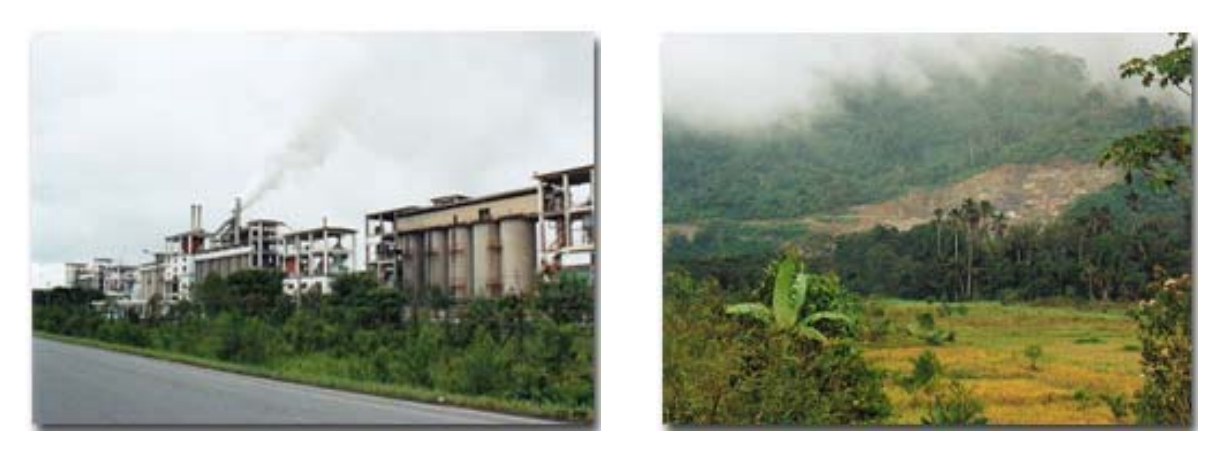
Cement factory on the highway, with constant emissions into the atmosphere and a quarry within the protected area