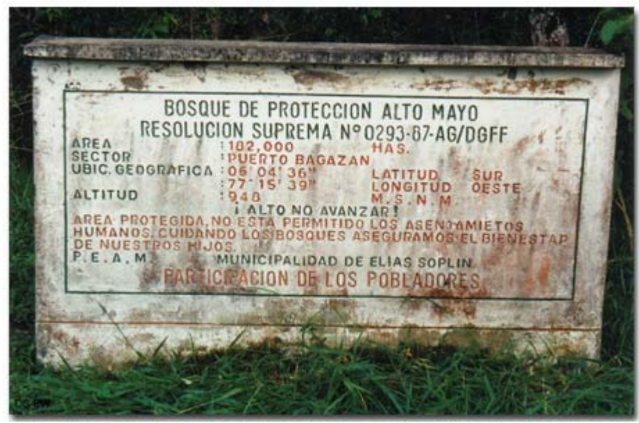
Information sign