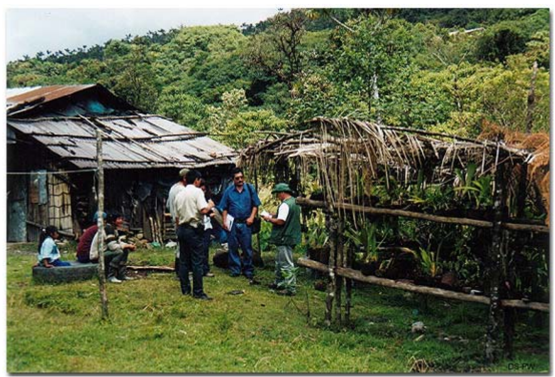
Natural Protected Areas Intendancy intervention at an illegal orchid shop in the interior of Alto Mayo Protected Forest. The operation was carried out with help fro the Technical Forest and Fauna Control Administration and the National Police (17/7/03)

The main buyers of orchids and butterflies should be identified with the help of local peoples, and given notice to cease their illegal activities. These buyers and sellers should be fined and used as an example in order to dissuade future trading. In the case of repeat offenders, they should be jailed for their crimes against the environment.