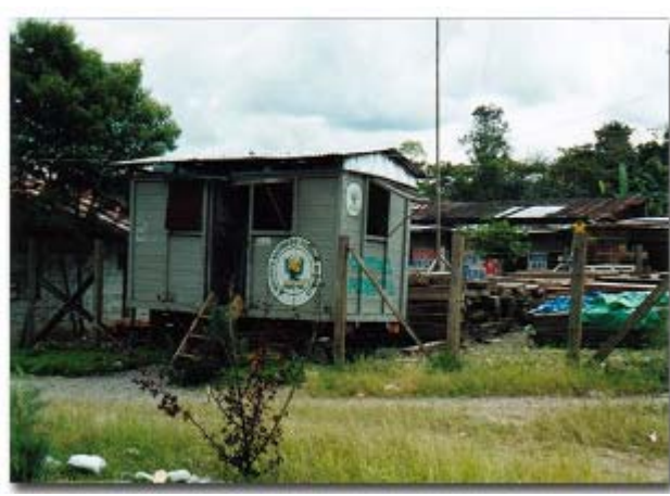
INRENA forest control point in Aguas Claras, photo © Diego Shoobridge.

Although the timber activity is limited due to the area's geography, selective timber extraction continues in the zone, above all Tornillo ( Cedrelinga catenaeformis ) and Virola sp., which constitute the majority of the illegal extraction. The harvesters do not have any type of harvest permission, nor do they have concessions or follow any sort of management plan. Extensive use of power saws to fell trees and prepare the boards in situ to facilitate transportation has contributed to the irrational use of the forest resources in the region. There are traders and carpenters that contract out to small extractors that do the hard work in the field and then bring them the wood.<sup>27</sup> If there is wood of greater value, it is sent by truck to the coast in the city of Chiclayo, lower quality wood is also included that is mainly used in construction. For transportation, the traders obtain false or forged documentation in order to pass the checkpoints on the highway. They place the boards under cargo such as coffee and it is difficult to detect. The local carpenters are also important part of the demand for wood.